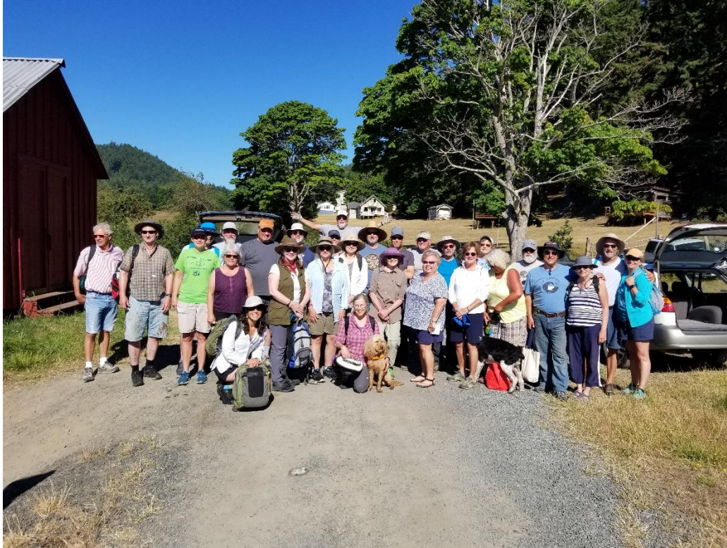
2021 Bellingham CYC Work Party

For many years the Bellingham Corinthian Yacht Club has come to Turn Point on the 4 th Saturday in June. This is just before the station opens to tourists with docents present. They provide a valuable service to TPLPS as they get the station looking pretty spiffy. We thank them for their service and dedication to Turn Point. Due to the pandemic, they were not there in 2020.