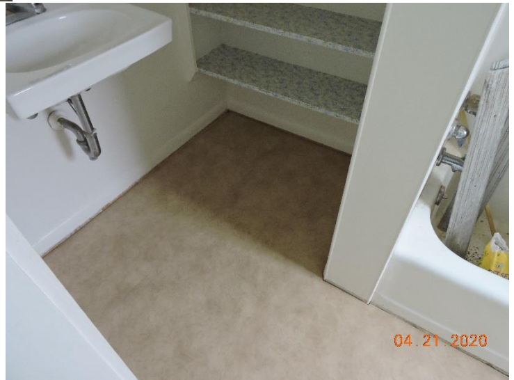
Bathroom after – New vinyl floor and dry rot gone